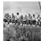
Construction Workers Lunching on a Crossbeam, 1932 Buy Now